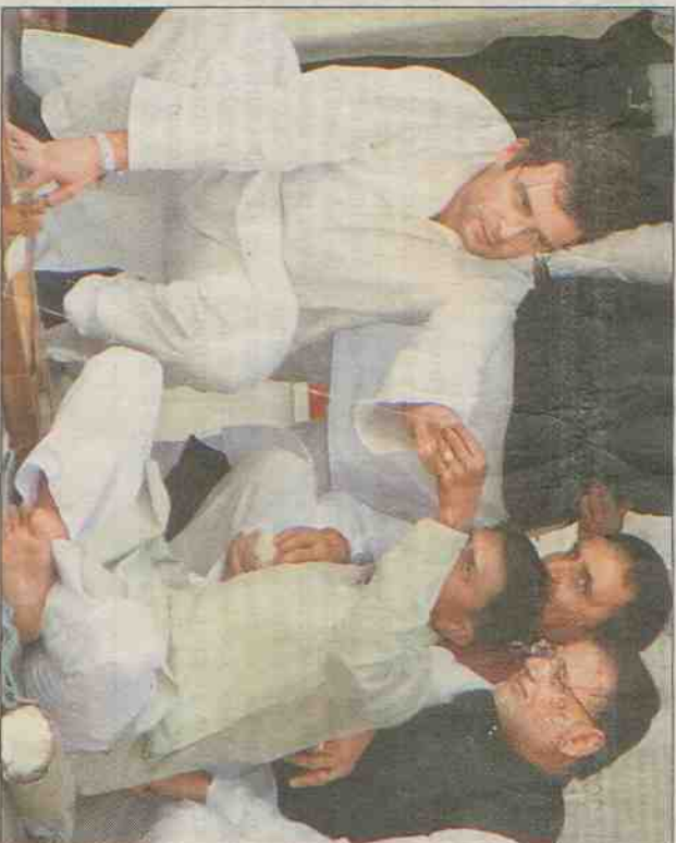
Congress leader Rahul Gandhi tries his hand at spinning wheel at Sabarmati Ashram in Ahmedabad on Friday

"People call me inexperienced, a child in politics, but I have Gandhi as my guide. Whenever I am faced with a problem or do not know an answer to a question, I refer to a book of quotations from Gandhi to find answers," he said. He even thanked Gujarat for giving the country a man who gave the country independence. He thanked Gujaratis as it is the state that has given him a philosopher and guide.